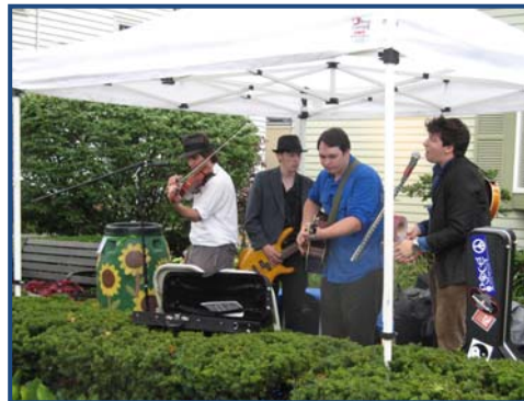
Viva Geneva 2009

These are fun events for the whole community. Please support GAF and Geneva schools by becoming a member and/or participating in one of our fundraisers.